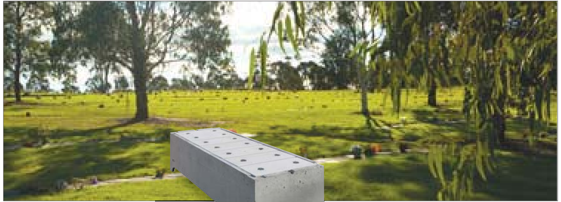
OPEL used in a lawn cemetery

Norwalk's - One Piece Earth Liners simplify tasks for your staff, providing peace of mind on the day of interment