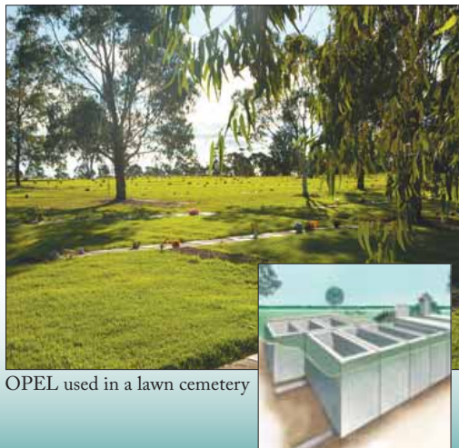
OPEL used in a lawn cemetery